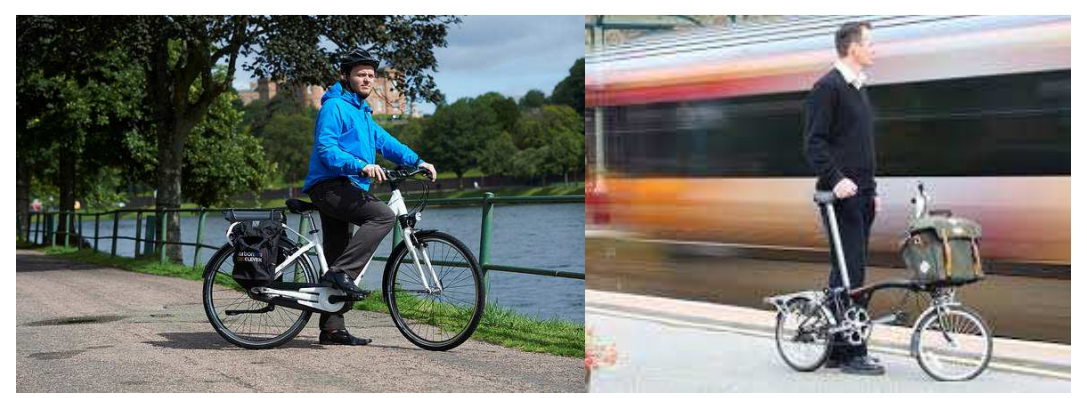
Figure 1 Electric bike

In order to qualify for the scheme, organisations must have or be willing to install a secure parking area for the bikes and operate a booking system which makes the bikes available for long and short hire at no cost.